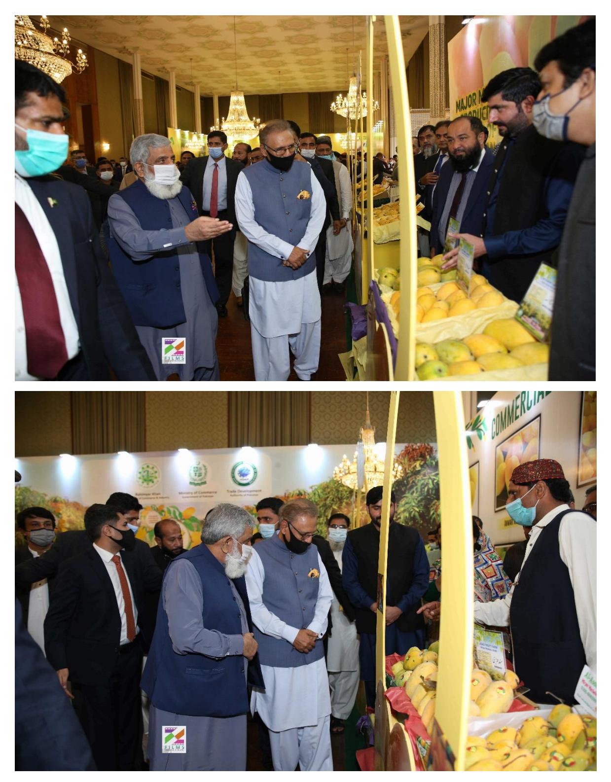
Chief Guest visiting Mango stalls