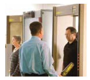
Walk Through Gates