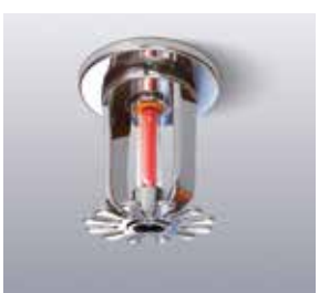
Fire Sprinkler System