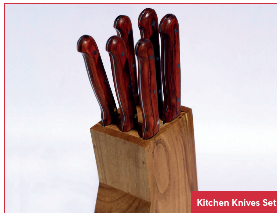
Kitchen Knives Set