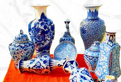
Multani Blue Pottery Products